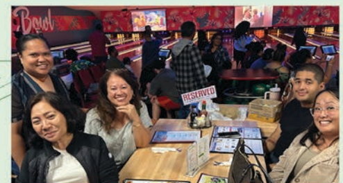
AIEA BOWLING EVENT