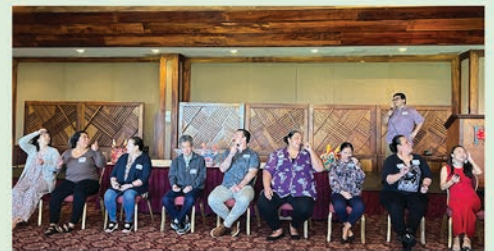
NEW YEARS HOLIDAY PARTY

The beginning of HLEFCU's 2024 was full of community and togetherness, with our holiday party and bowling night allowing us to come together and celebrate a year of hard work and looking forward to another year serving our law enforcement 'ohana. In March, we were also honored to sponsor a small portion of Crimestopper's annual fundraising gala at The Kahala Hotel, and give our members a fun night out at our Annual Meeting and Dinner at the Ala Moana Hotel.