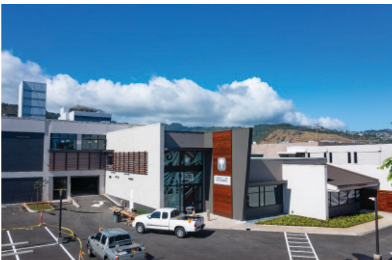
King Street view of our new headquarters.

Work continues at our new headquarters and main branch! Here are a few photos of our progress as of mid-June 2021.