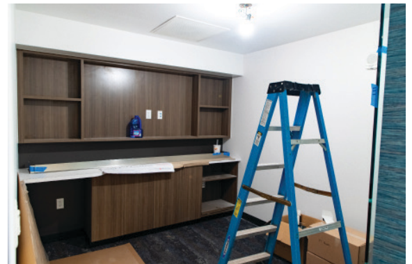
Consultation room furniture installation.