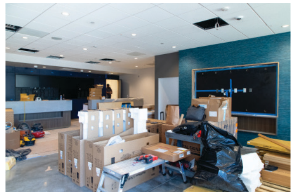
Member lounge & teller line taking shape.