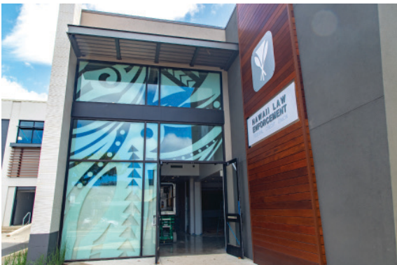
Our new main branch's front entrance.