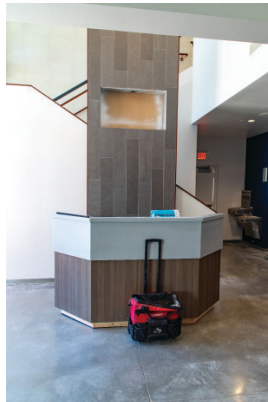
The main branch concierge stand.